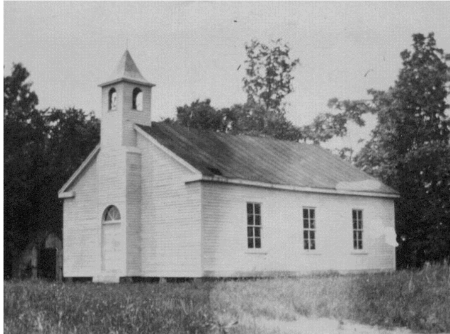
Older Church building that burned in 1942