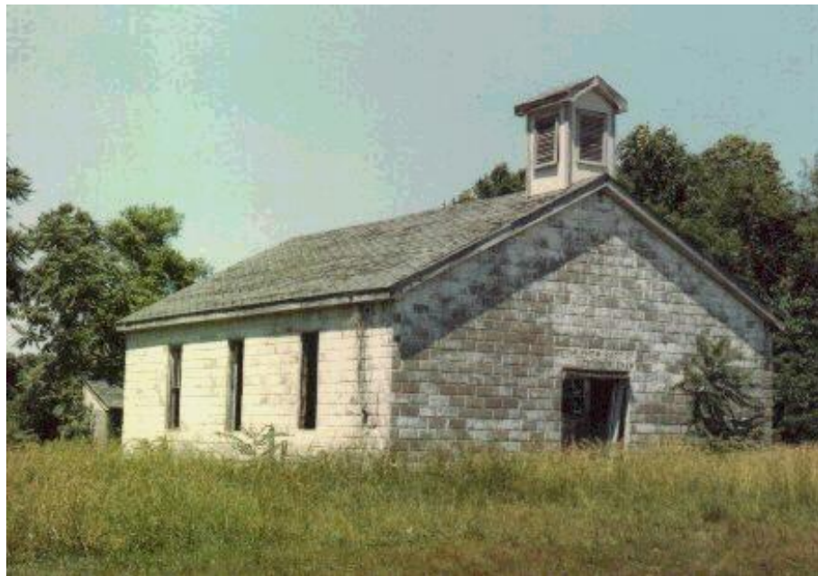
Church that was built in 1946; picture taken in 1980 by Jerry Long