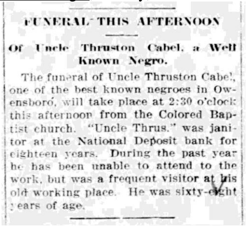
Owensboro Messenger, Sunday, 12 November 1905, p9