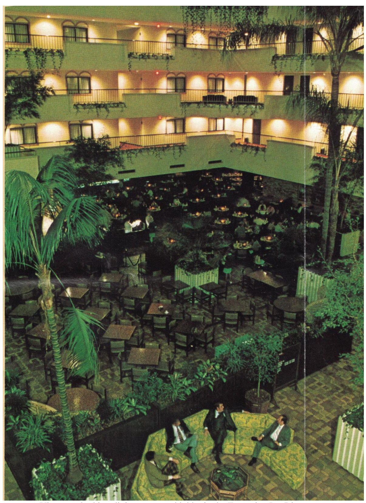
View overlooking dining room and lobby in the Executive Inn Rivermont