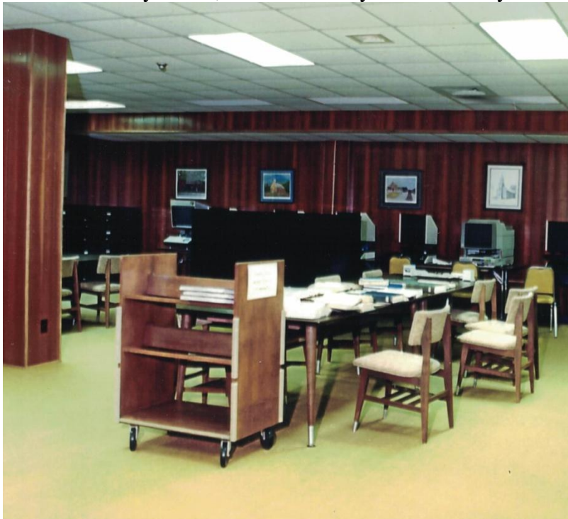
Kentucky Room, 450 Griffith Avenue, Owensboro, 1985