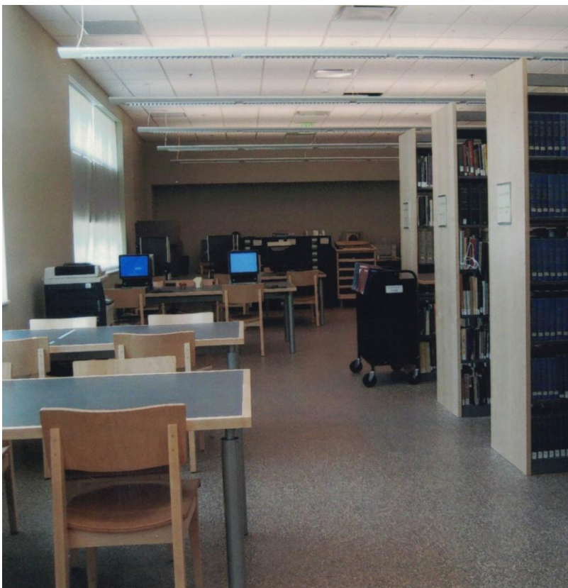
Kentucky Room, 2020 Frederica Street, Owensboro, 2007