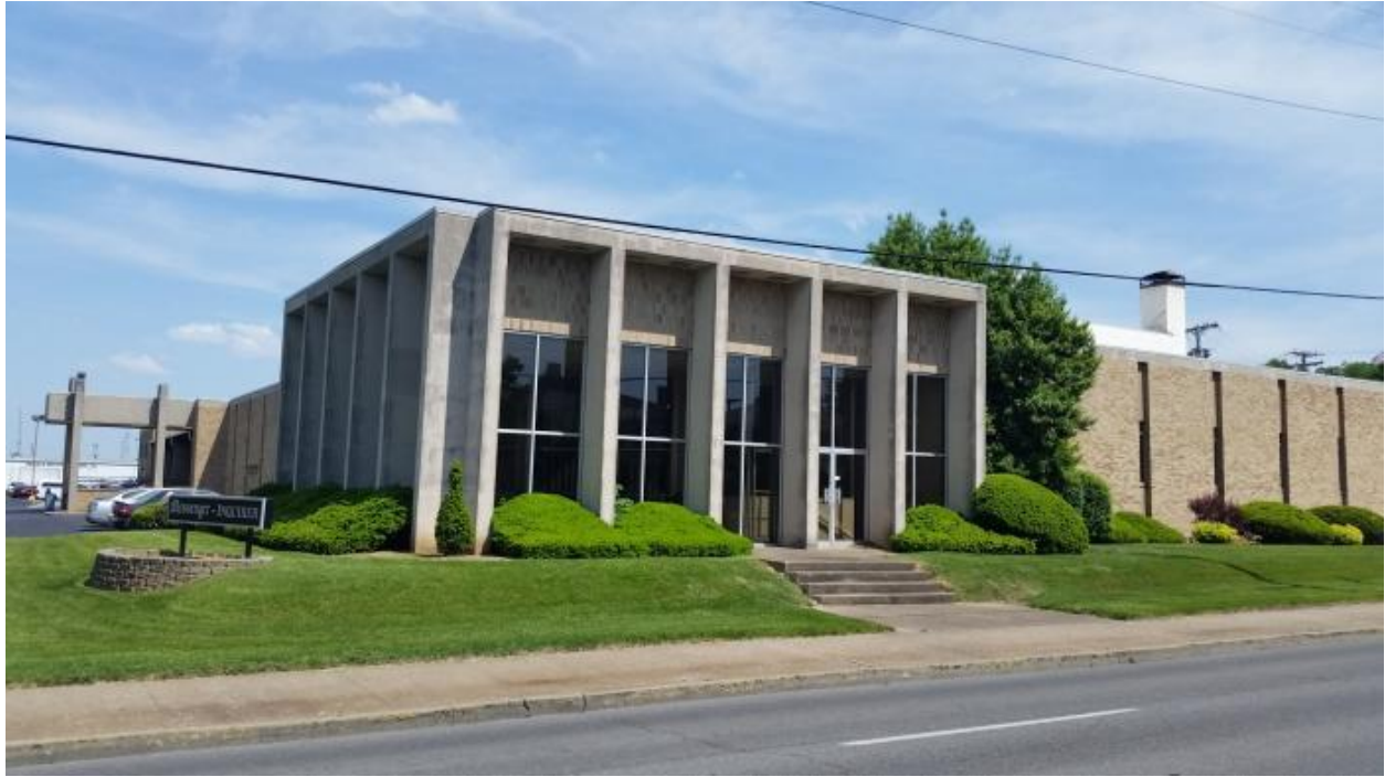
Messenger-Inquirer, 1401 Frederica St., Owensboro, KY