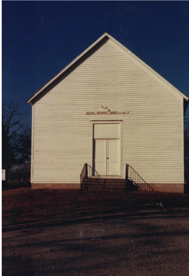
(Old) Bethel Methodist Church Picture taken by Jerry Long On 19 November 1987