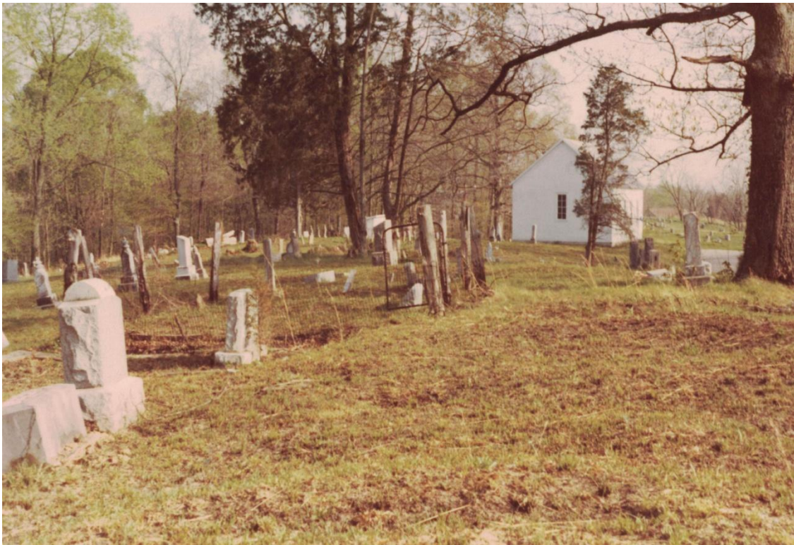
View looking toward back of Bethel Church & cemetery (old section). In edge of woods to the right of the church is the Bethel African American Cemetery. Picture taken by Jerry Long on 23 April 1980.

On Highway 62 about four miles east of Beaver Dam turn north onto the Bethel Church Road. Down about three-fourths of a mile is the Old Bethel Methodist Church and cemetery. The African American cemetery is across the road from the church in the edge of the woods. Jerry Long copied the cemetery on 19 November 1987.