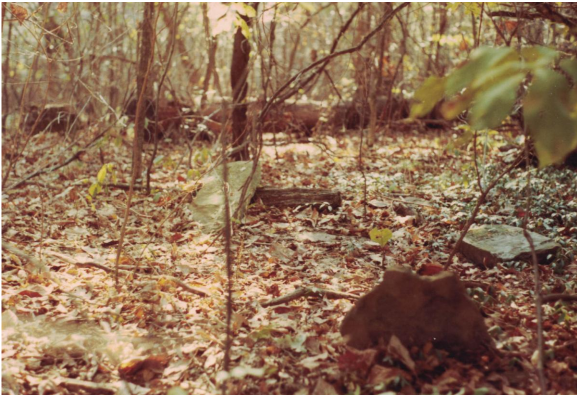
Photo taken in the Faught Cemetery on 7 October 1980