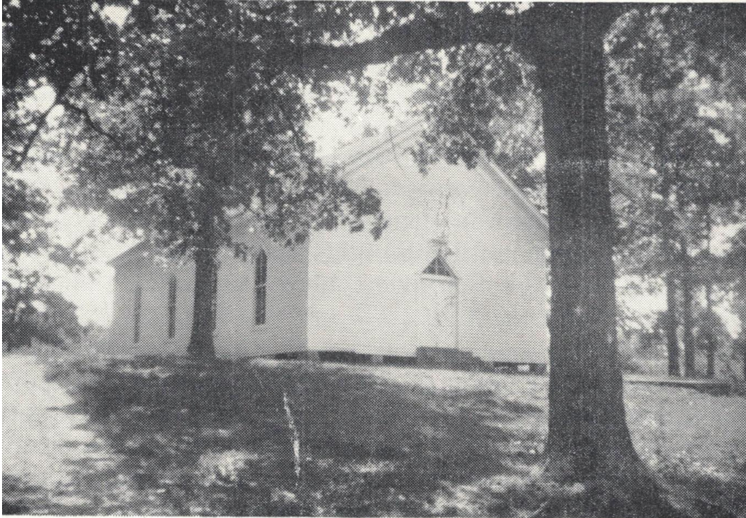
MT. HERMON CHURCH