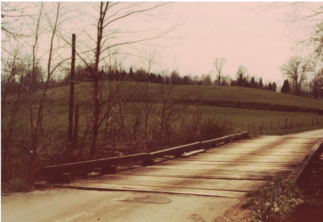
Bridge over Blackford Creek on Goering Road below the Hale – Powers Cemetery