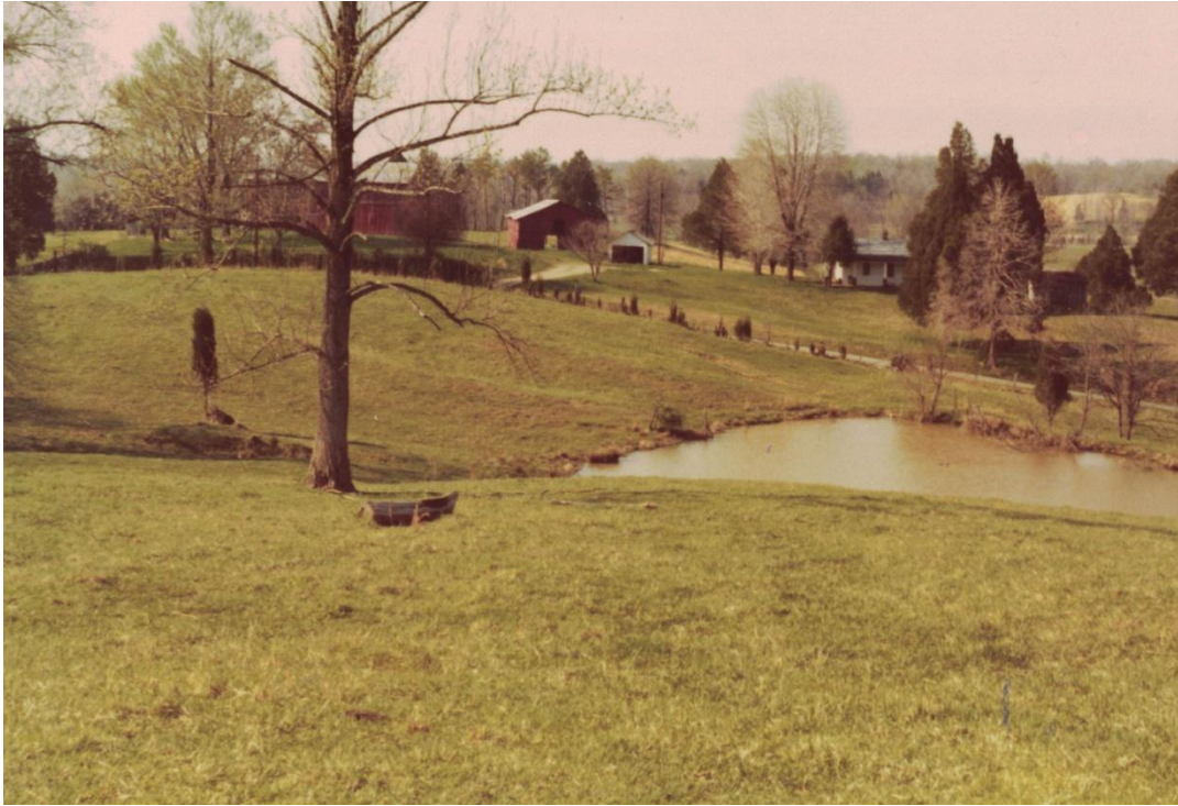
View looking towards Goering Road below the Hale – Powers Cemetery