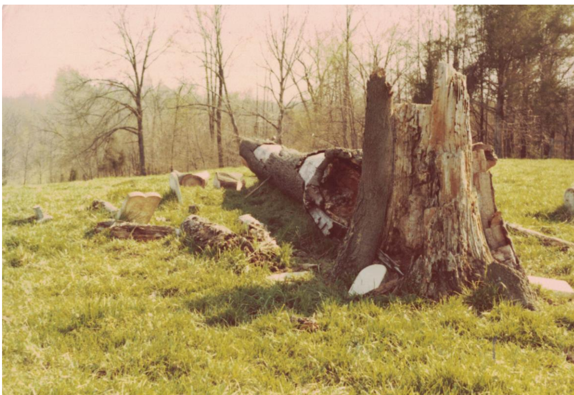
View of Hale – Powers Cemetery