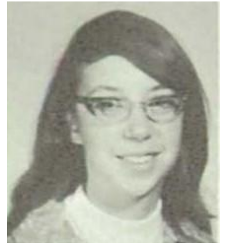
1968 Our Lady of Mercy High School Farmington, MI