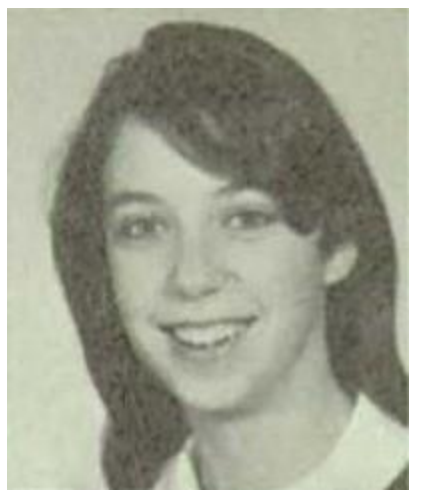
1967 Our Lady of Mercy High School Farmington, MI