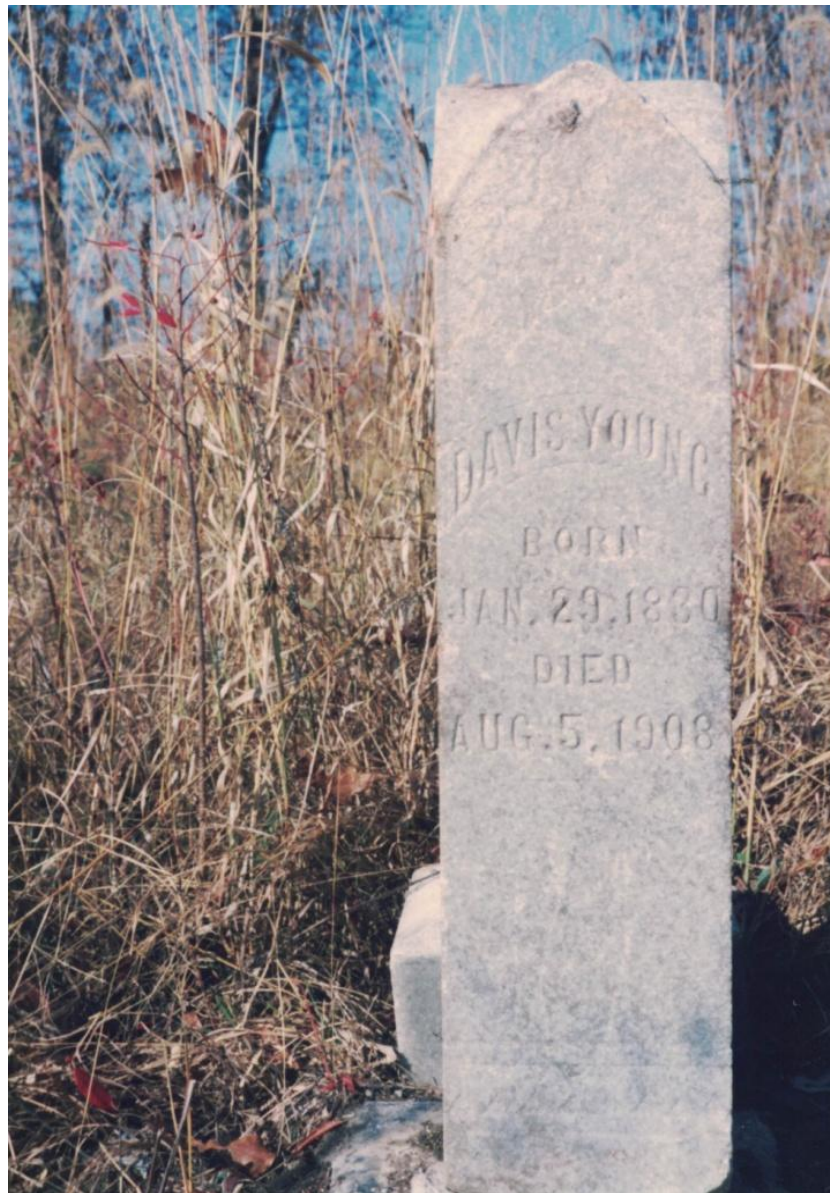
24 October 1986