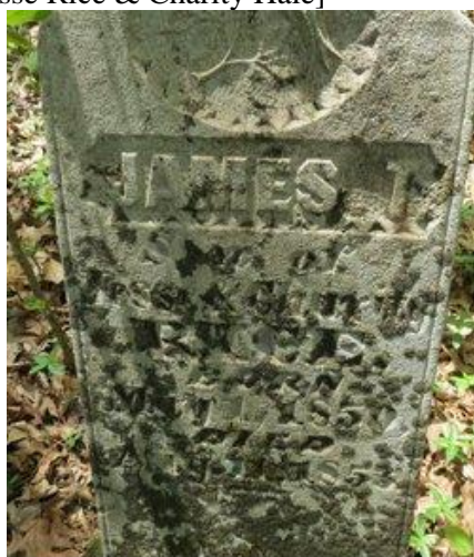
earliest death date found in the cemetery