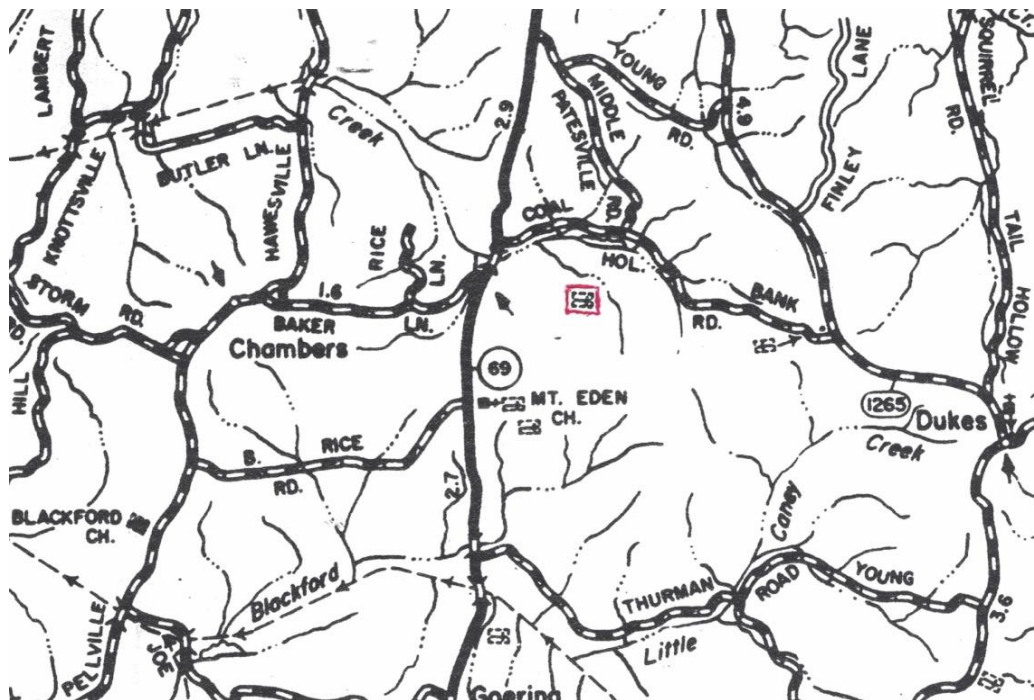
Rice Cemetery is outlined in red