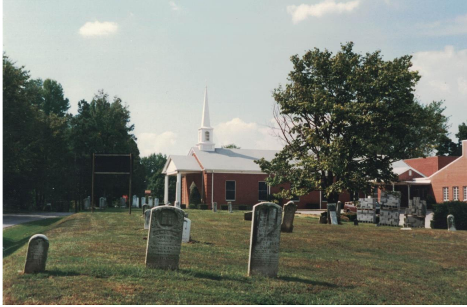
Old section of the Macedonia Baptist Church Cemetery. Six months later the old section was moved across the road to the new cemetery.