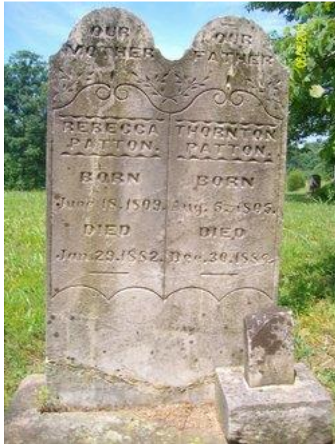
Hartford Herald , Hartford, KY Wednesday, 7 January 1885 p3