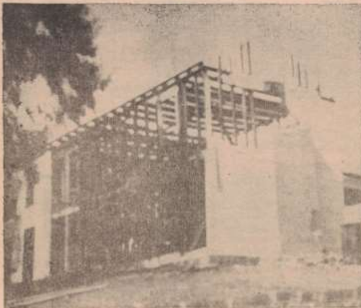
"AIN'T GONNA NEED THIS HOUSE NO LONGER" —Pictured above is the old Adair house on Main Street, one of the oldest homes in the county, being torn down.