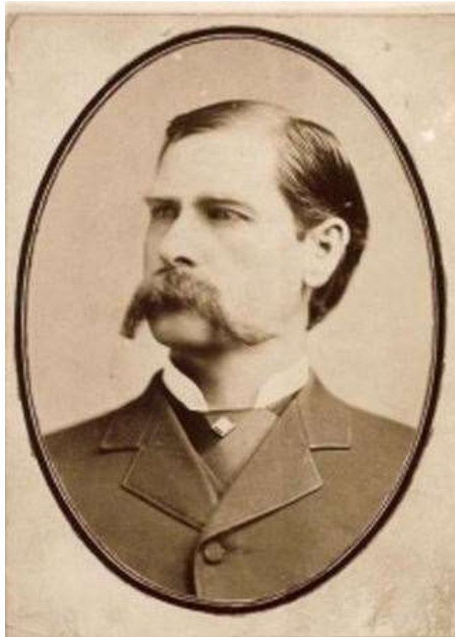
Wyatt Earp (1848-1929) about 1886