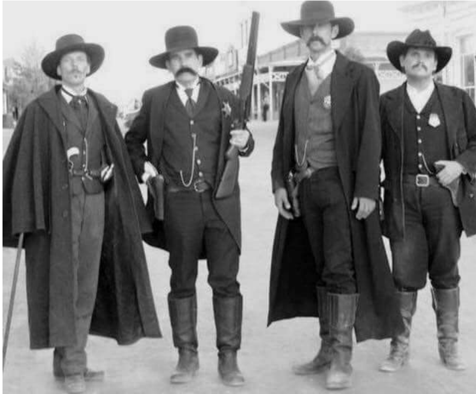
The Earp brothers and Doc Holiday - From left to right: Doc Holliday, Virgil Earp, Wyatt Earp, Morgan Earp. At Tombstone