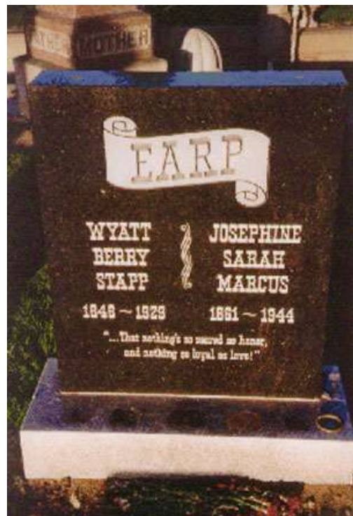
Grave of Wyatt Earp at Hills of Eternity Memorial Park, Colma, CA