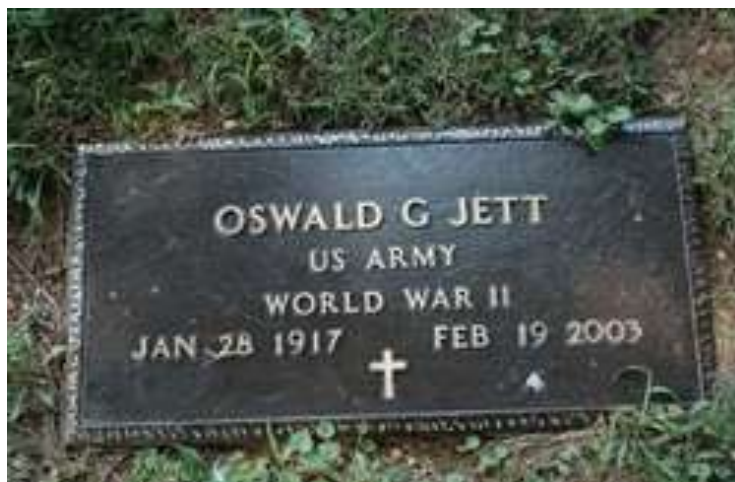
Hillcrest Memorial Park Cemetery, Lexington, KY