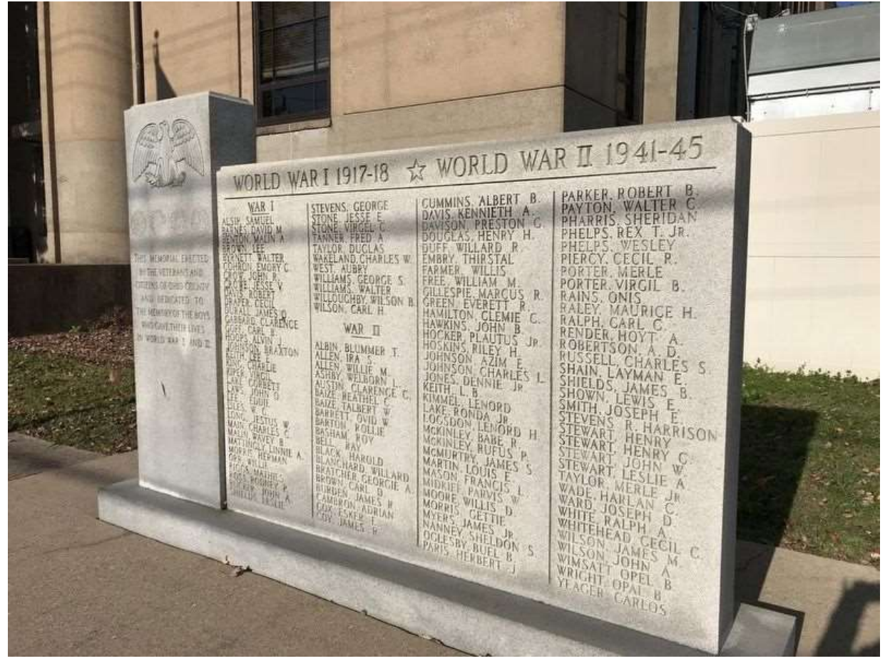
Memorial on the Ohio County Courthouse lawn

This memorial erected by the veterans and citizens of Ohio County