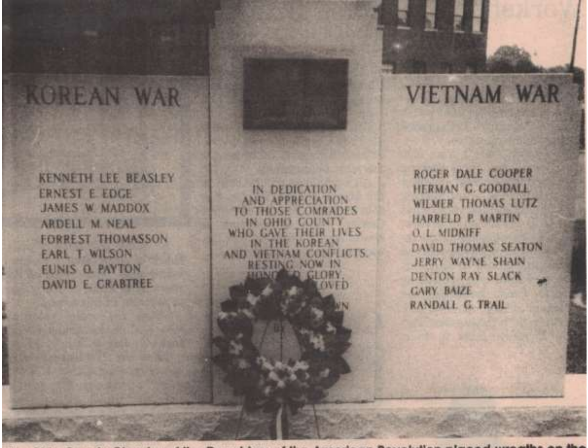
The Ohio County Chapter of the Daughters of the American Revolution placed wreaths on the World War II memorial at the Ohio County Courthouse and the Vietnam-Korean memorial at the Ohio County Community Center in observance of Memorial Day.

The Korean – Vietnam War memorial was dedicated on 25 May 1987 (five names were subsequently added to the monument)