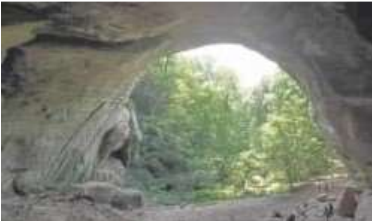
The entrance to Morgan's Cave