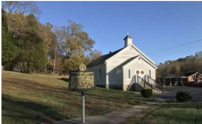
Pleasant Point Baptist Church, Pleasant Ridge, KY