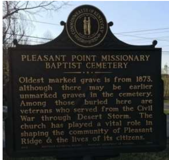
Marker is on Kentucky Route 764 just south of U.S. 231, on the right when traveling north.