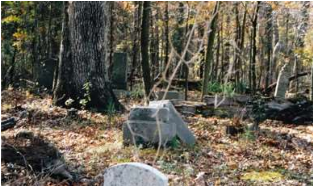
Wheatley Cemetery, Dukes, Hancock County, KY