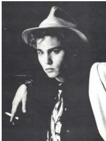
Johnny Depp has many relatives in Daviess and Barren Counties.