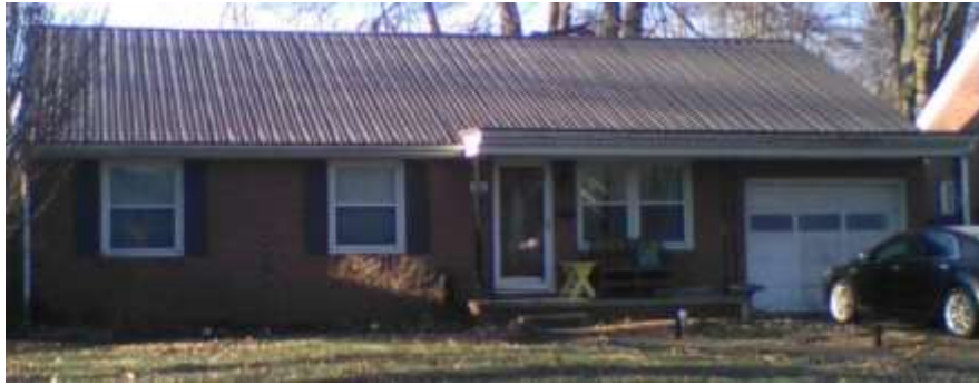
518 Stockton Drive, Owensboro – home of Johnny Depp, 1963-1965