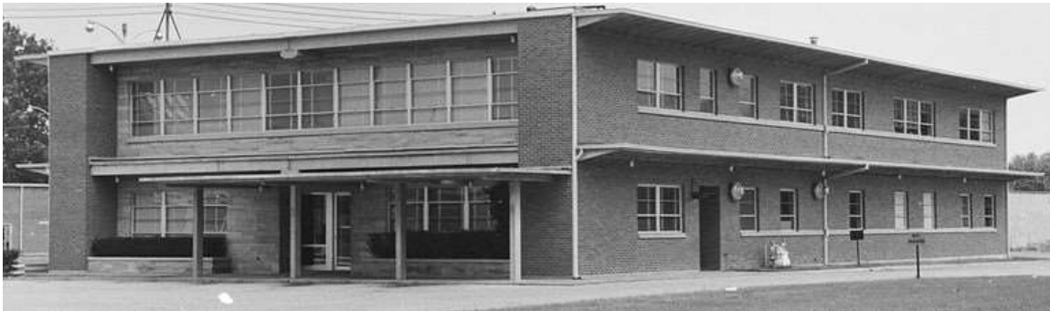
Johnson, Depp & Quisenberry Building, 2625 Frederica St., Owensboro, KY, built in 1958.