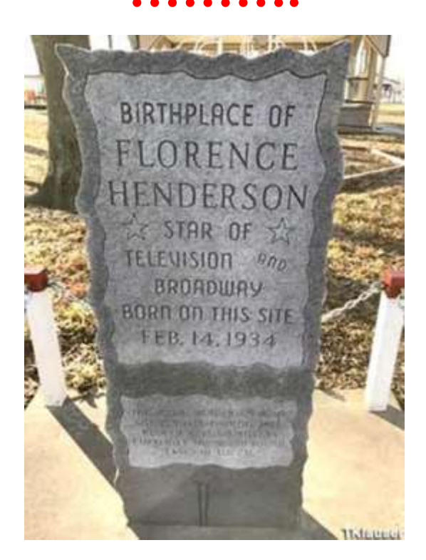
Memorial in Dale, Spencer County, IN - in a little park on the south side of 114 East Medcalf St. (IN 62) just east of its intersection with South Wallace St., across from an old grain elevator. Monument marks the almost-spot where Florence Henderson was born in 1934 – the actual spot is now buried under northbound US-231.