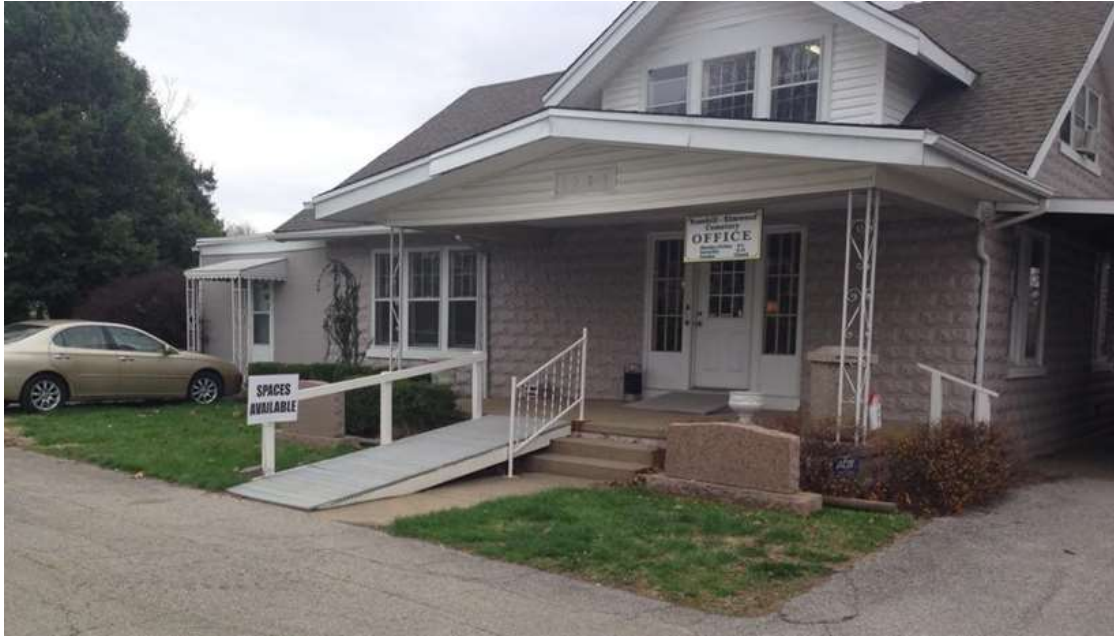
Rosehill – Elmwood Cemetery & Mausoleum, 1300 Old Hartford Road Owensboro, KY

In 2009 a printout of the Rosehill – Elmwood Cemetery office records from April 1914 to May 1999 was donated to the Kentucky Room, at the Daviess County Public Library, in Owensboro, KY (library call #KR 976.9864 Elmw). These records record the name, date of burial, age, cemetery name (represented by an E or R), section & lot number. Other details may be given on the original records. The cemetery office has a plat showing the sections and lot numbers in the cemeteries.