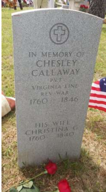
Marker in honor of Chesley Callaway dedicated in the Old Mill Cemetery on 7 June 2014