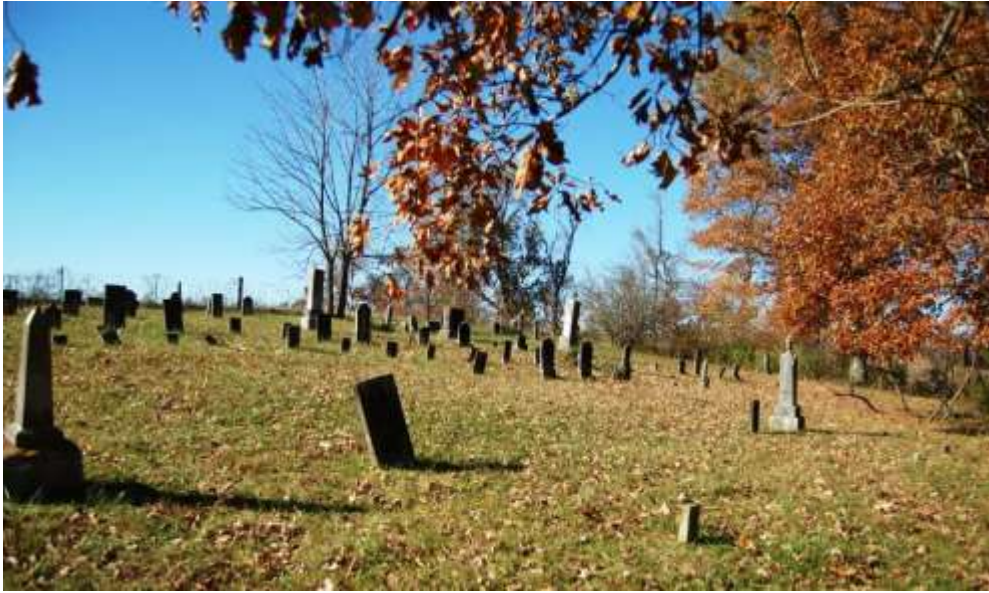
Photo of Old Mill Cemetery