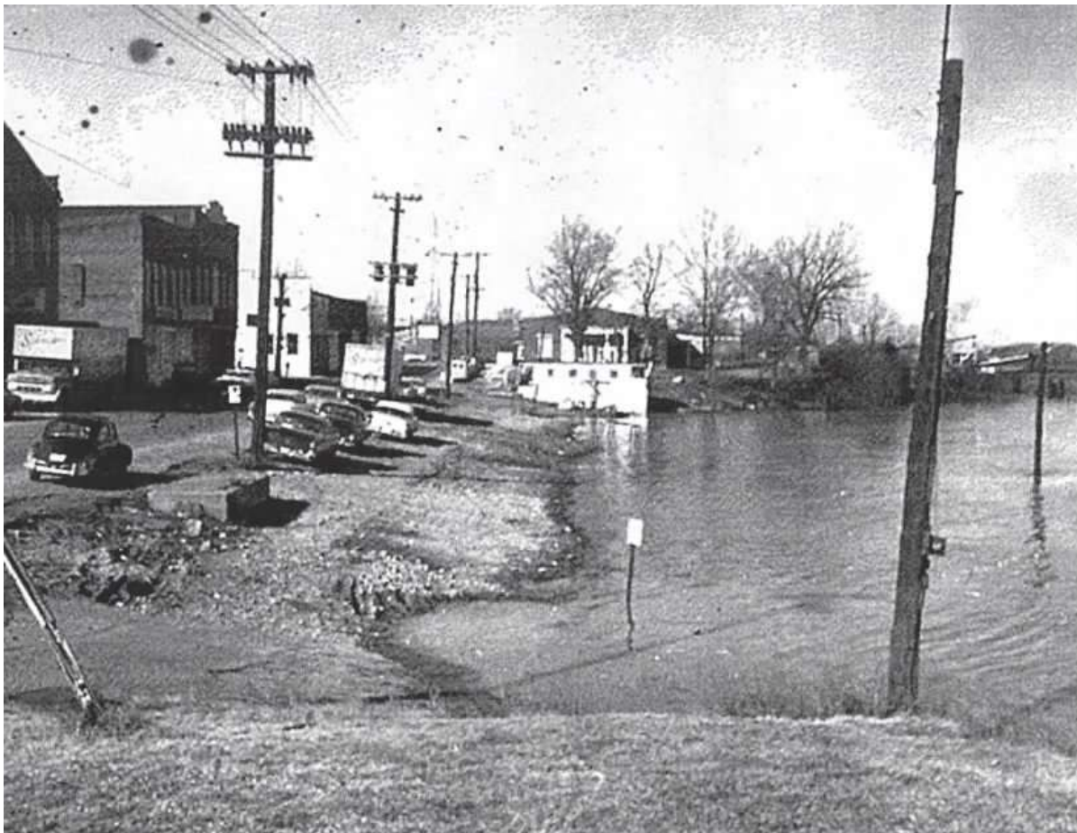
This old black-and-white photo shows Owensboro's riverfront from Smother's Park looking west toward the American Legion in 1963. Smothers Park's name has been changed repeatedly through the years, but what is now Smothers Park is believed to be along with the courthouse square the oldest public space in Owensboro.

That eventually led to the massive renovations to the riverfront that are being unveiled this week.