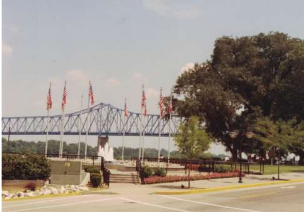
Pictures of Smothers Park. In 1988 water fountain and flags were erected at the west end of the park.