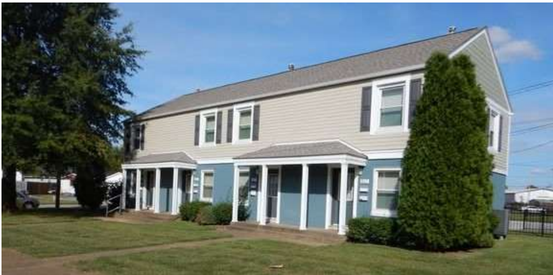
The Nannie Locke Apartments in October 2017 after exterior upgrade.