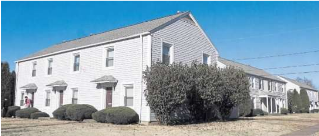
The Nannie Locke Apartments at East Eighth and Jackson streets, owned and operated by the Housing Authority of Owensboro, is in line for exterior upgrades in 2017. Fifty apartments were built in 1954 and dedicated on 16 January 1955. ( Messenger-Inquirer , Owensboro, KY, Saturday, 31 December 2016, p.1A)