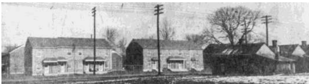
NANNIE LOCKE PROJECT consists of 50 units in the 8th and Jackson Street area. This photo shows the modern new brick residential buildings, contrasted with sub-standard dwellings across the street.

Tenants for the project apartments, which range in size from one to four-bedroom living units, are selected on a basis of families in greatest need. Special priority is accorded to disabled veterans in need of housing. Miss Baker stated. Generally speaking, the selection depends on two main factors – families having the lowest income and those living in sub-standard homes or in the worst slum conditions.