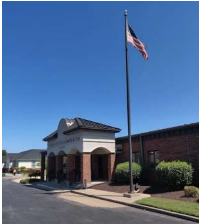
Wendell Foster Center Administration Building, 815 Triplett Street, Owensboro, KY